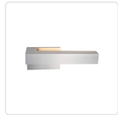
EW13212L-BN Brushed Nickel