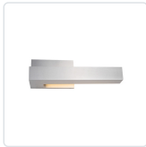
EW13212R-BN Brushed Nickel